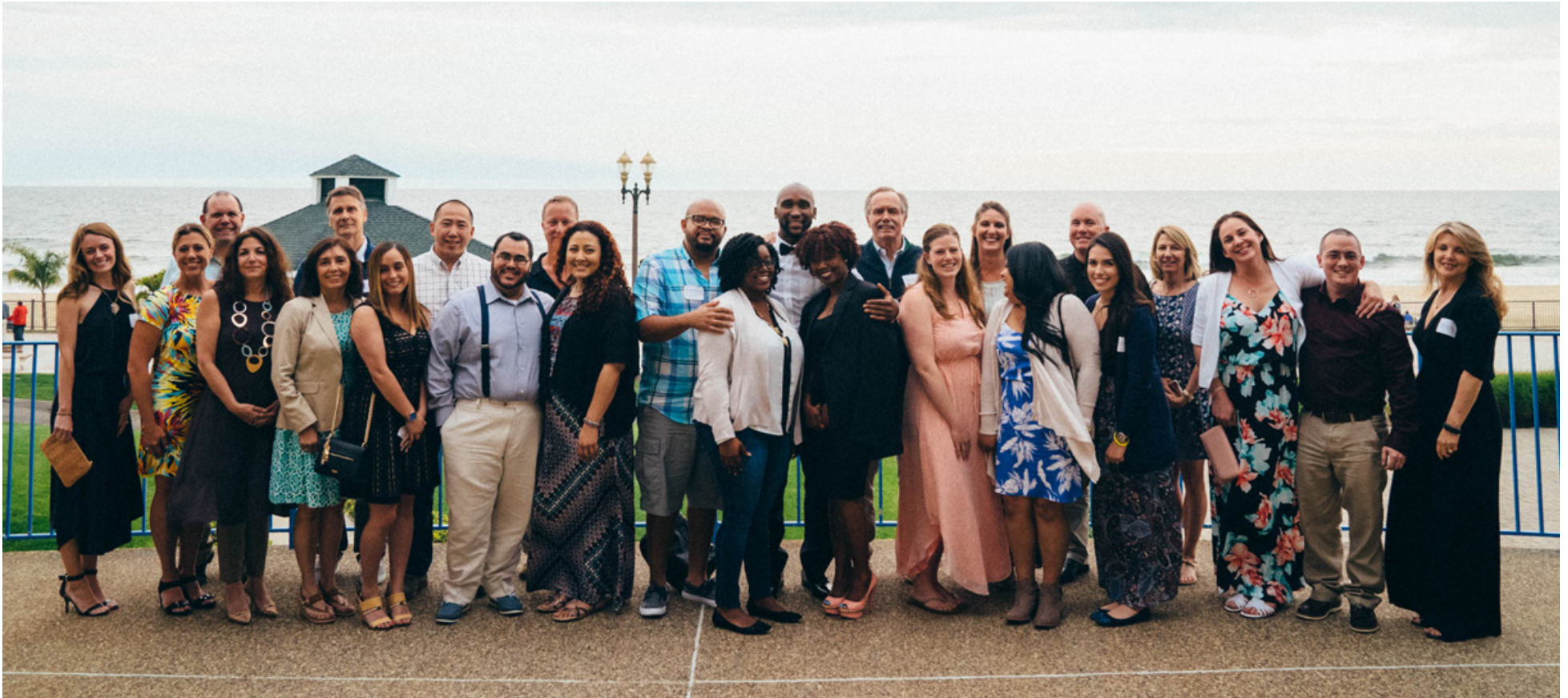
2016 Ambassadors and their guests celebrate alongside members of the Benjamin Moore Corporate Leadership team.