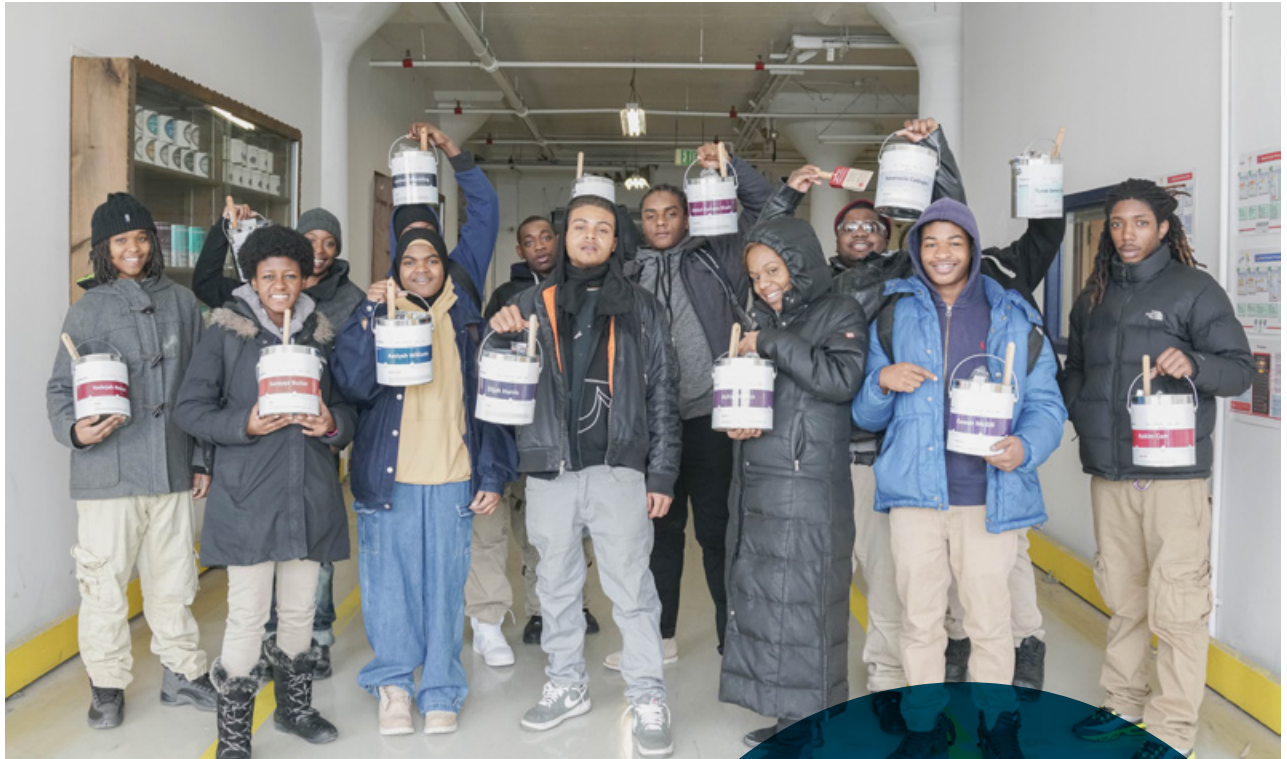
Students from YouthBuild Newark raise their personalized paint cans celebrating a successful trip to the Benjamin Moore Newark manufacturing facility.

In 2017, Benjamin Moore expanded our MoorePride @ Work program by hosting YouthBuild students and introducing them to potential careers within Benjamin Moore. Participating sites include manufacturing and logistics sites in Johnstown, New York; Newark and Clifton, New Jersey; Milford, Massachusetts; and Pomona, California. The idea originated with a successful pilot conceived by our logistics team in Landover, Maryland.