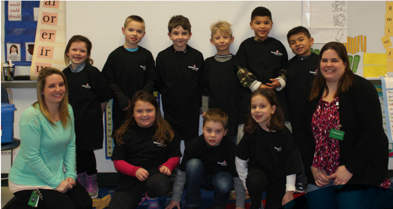
To share essential safety skills with the entire family, the SafeStart tool kit includes a set of videos geared towards children and young drivers. We brought the Boo Boo Bandits video and game to Clinton Elementary School in Clinton, Massachusetts, in early 2017 inspiring the children to take an interest in safety