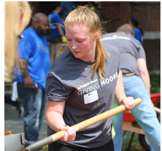
Benjamin Moore volunteers work alongside veterans with The Mission Continues at the organization's Charlie Orientation in Boston

Benjamin Moore is also the proud sponsor of TMC's Mass Deployment, supplying hundreds of gallons of paint as TMC veterans transformed some of Atlanta, Georgia's most challenging neighborhoods in June 2017.