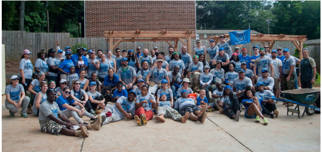
Veterans and volunteers from The Mission Continues "Mass Deployment" in Atlanta, Georgia

Our GIVING MOORE Foundation is also supporting two of the organization's Fellows in 2017 as they work towards expanding their professional development. We are proud of these TMC Fellows as they translate their military-based skills into community service through volunteerism; network with community groups and companies; and adjust to post-military life through a renewed commitment to service at home.